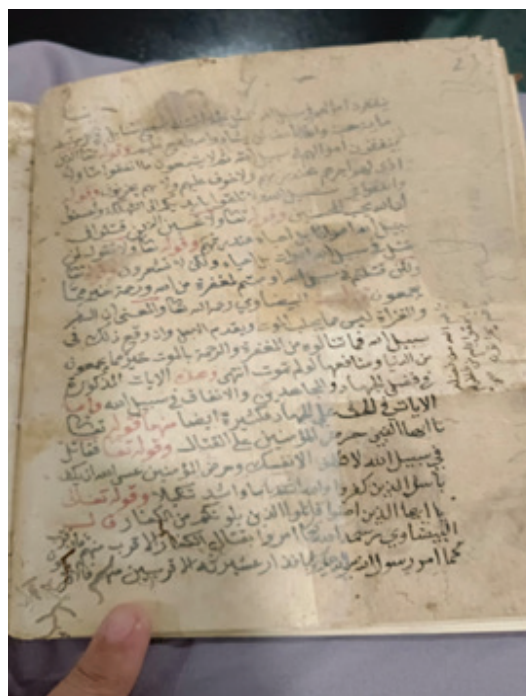
Content of Nashihah al-Muslimin wa Tadhkirah al-Mukminin